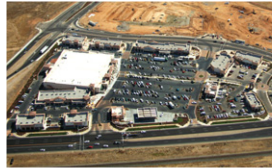
▲ Lincoln, California

These services have a major impact on a project's overall success. Together, they define Building with a Difference™.