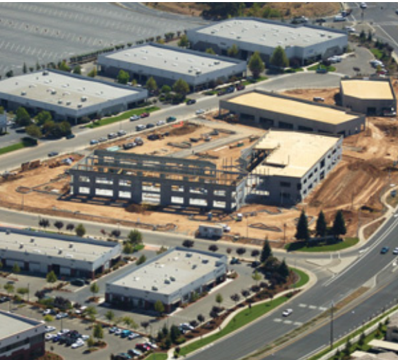
▲ Roseville, California

Our in-house expeditor helps avoid permitting delays that can hold up a project. This permitting expert has built solid relationships with local agencies, and works closely with the project team to move the process forward on schedule.