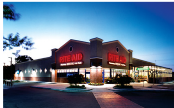
▲ Rite Aid, Sacramento, CA

Sierra View knows how to help our retail clients build cost-effective and timely projects to meet critical target dates.