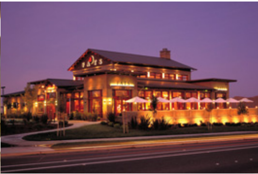
▲ Fat's Asia Bistro, Roseville, California

Sierra View has built over 300 restaurants, from upscale restaurants to family dining chains. Sierra View's vast restaurant construction experience enables us to assist our restaurant clients with everything from financing assistance to ambiance enhancement. That's why we have so many repeat restaurant clients who come back again and again for our value-added services.