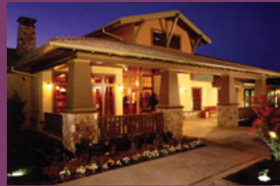
▲ Springfield at Whitney Oaks, ▶ Rocklin, California

Indoor, outdoor, winter, summer; public park or individual passion – Sierra View supports leisure activity in all its many forms.