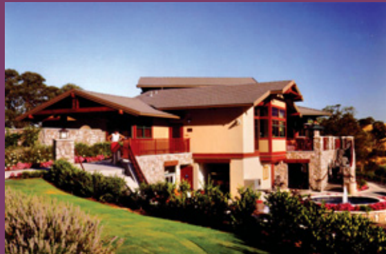
▲ Whitney Oaks Golf Clubhouse, Rocklin, California ▼